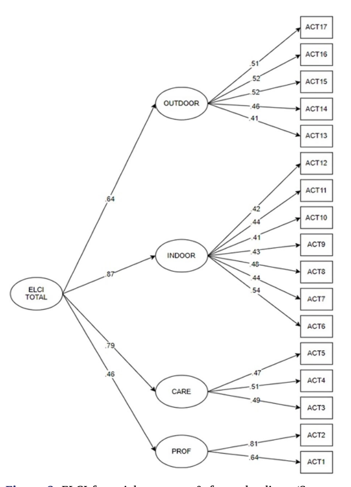
Figure 2. ELCI factorial structure & factor loadings

The total score of ELCI questionnaire had moderate to high correlations with all its constituent factors, while intercorrelations among the various factors were also significant, although lower.